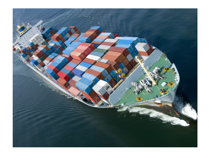
THE GABONESE PROGRAM OF CONFORMITY (PROGEC)